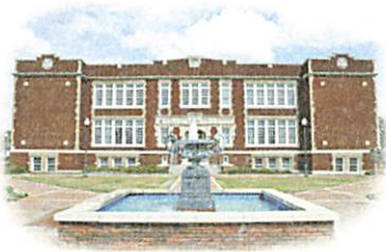
ANDALUSIA CITY HALL