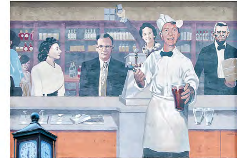
Riley's Soda Shop Mural