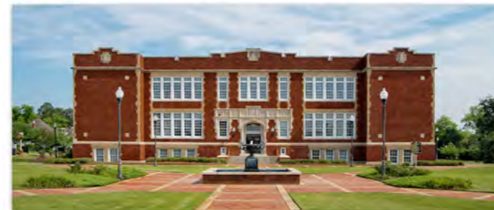
Andalusia City Hall

CITY OF ANDALUSIA 505 East Three Notch Street PO Box 429 Andalusia, AL 36420