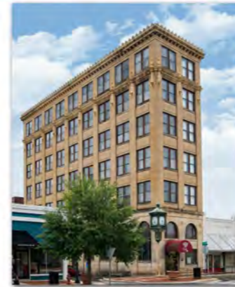
First National Bank Building