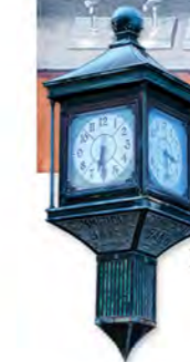
First National Bank Clock