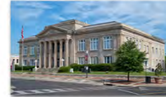
Covington County Courthouse