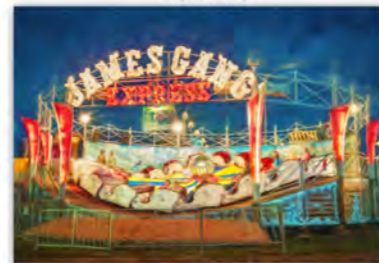
Covington County Fair