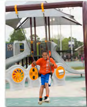
PowerSouth Miracle League Park